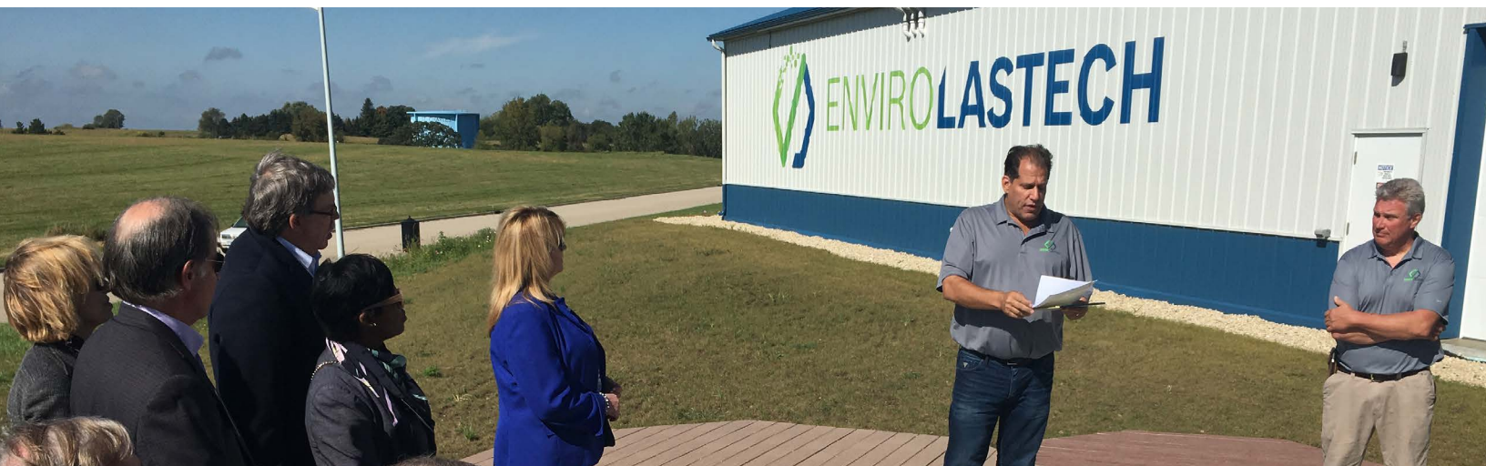
Envirolastech in St. Charles, Commissioners on Wheels Tour 2017

Minnesota Business First Stop has also improved coordination between commissioners from the partner agencies. Working together more closely helps streamline business assistance, but has also enabled the state to better address fast-emerging challenges – such as the propane crisis of 2014 and the turkey virus outbreak of 2015.