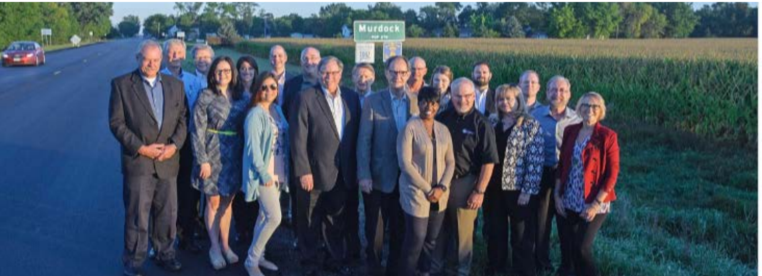
Commissioners on Wheels Tour 2016

“First Stop builds partnerships between the commissioners and their staffs. The agencies work more efficiently together, benefitting business startups and expansions. The annual tours enable us to see firsthand how a streamlined approach helps businesses succeed.”