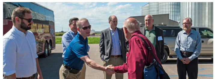
Wheaton-Dumont Co-op Elevator’s Graceville Grain Terminal, Commissioners on Wheels Tour 2016

2013: West Metro region (1 day): Minnetonka, Plymouth and Golden Valley