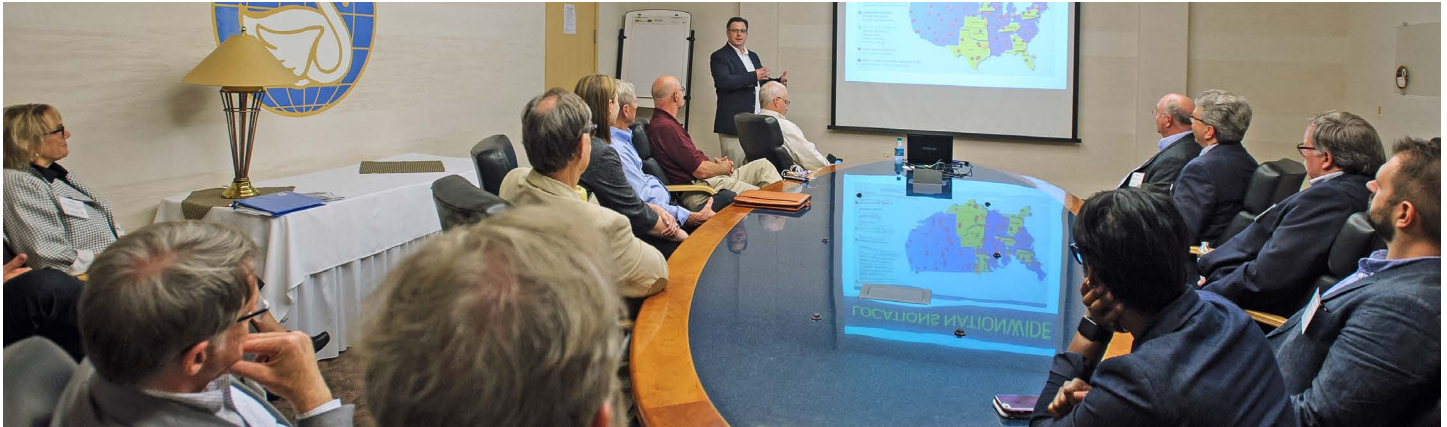
Schwan's Company in Marshall, Commissioners on Wheels Tour 2016