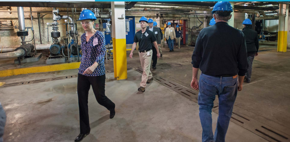
American Crystal Sugar in Moorhead, Commissioners on Wheels Tour 2016

“First Stop makes it easier for entrepreneurs to start or grow their business in Minnesota. We help make sure we’re providing the resources, connections and referrals for businesses looking to start up, expand, or relocate here.”