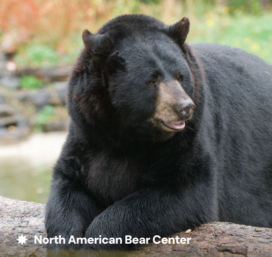
★ North American Bear Center