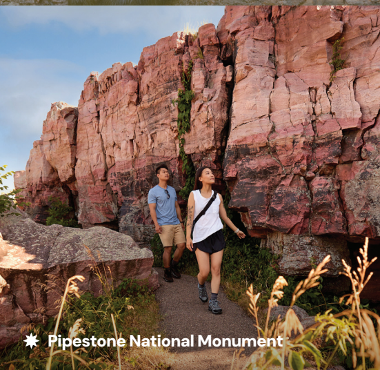
★ Pipestone National Monument