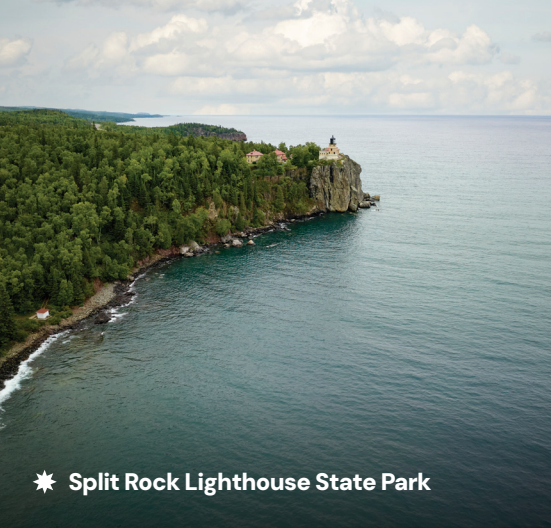
★ Split Rock Lighthouse State Park