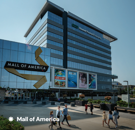
★ Mall of America