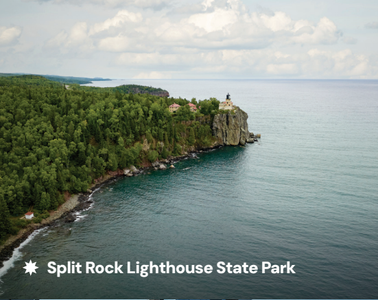
★ Split Rock Lighthouse State Park