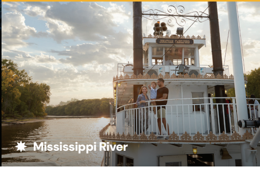
★ Mississippi River