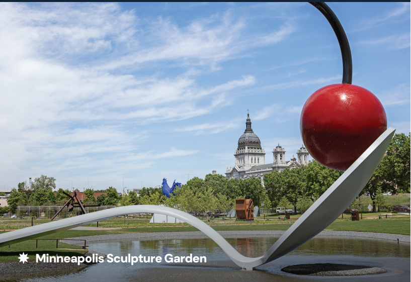
★ Minneapolis Sculpture Garden