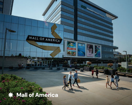
★ Mall of America