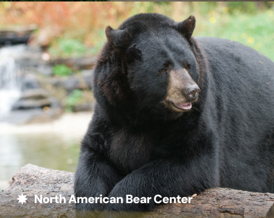
★ North American Bear Center