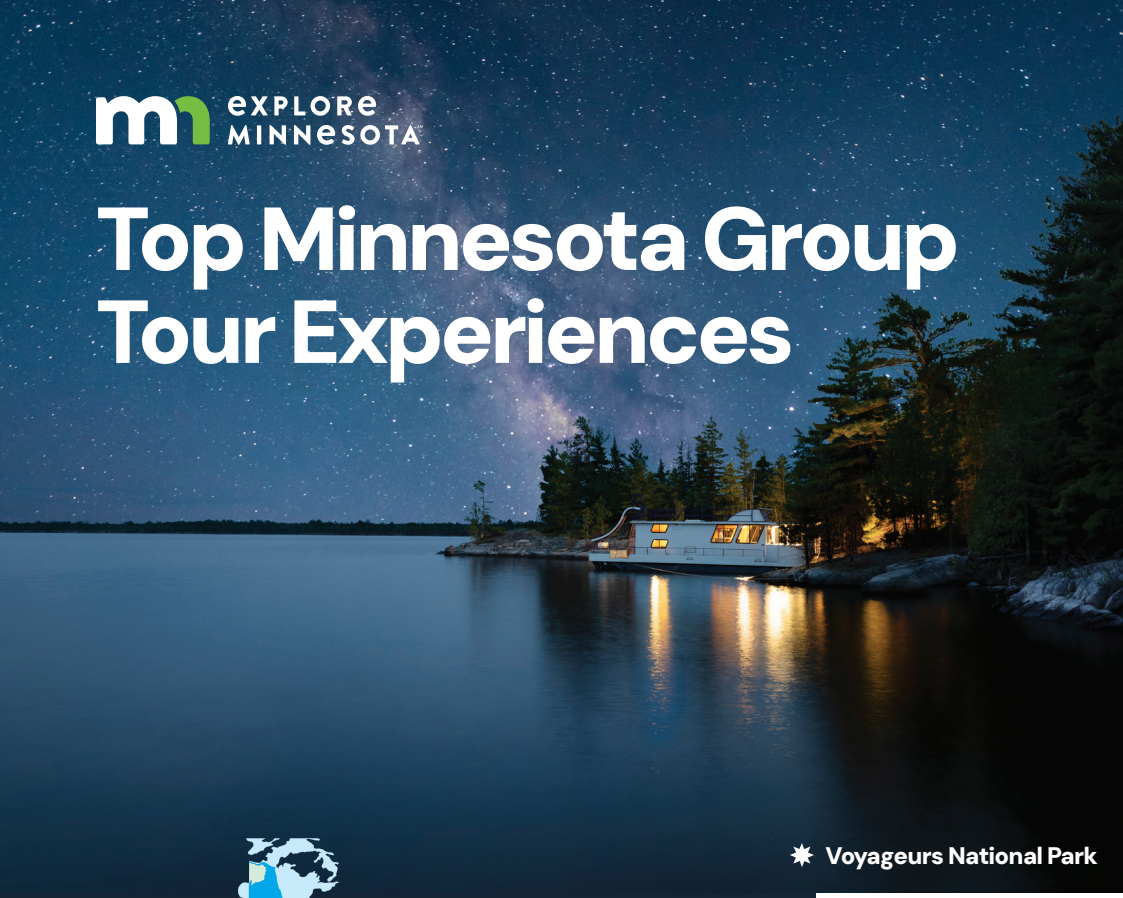
★ Voyageurs National Park