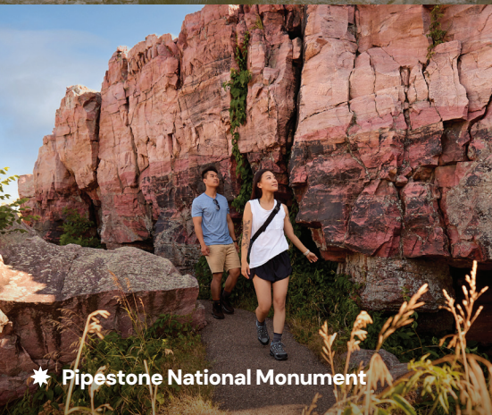
★ Pipestone National Monument