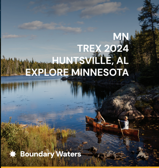
★ Boundary Waters